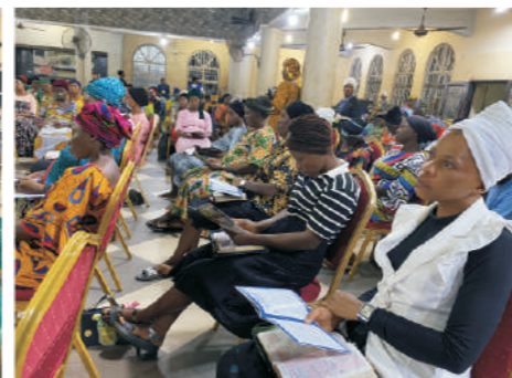
Cross Session of listeners