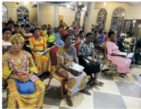
Cross Session of Attendees