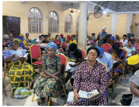
Washed by the Word