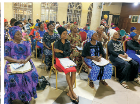
The Word I found