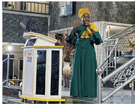
National Women Leader