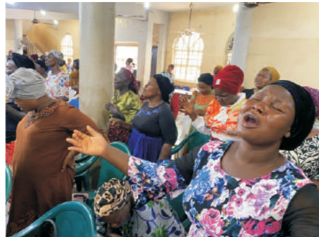
A heart of Worship