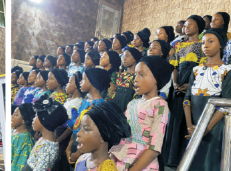
Little Sisters were involved