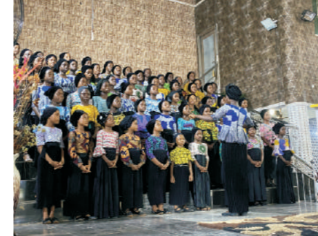
The Children Choir