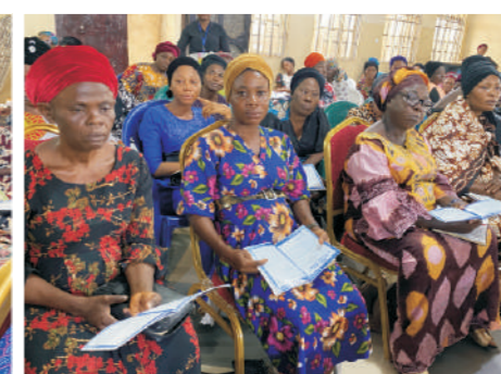
We praise in the Sanctuary