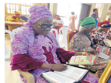
Faith cometh by the Word