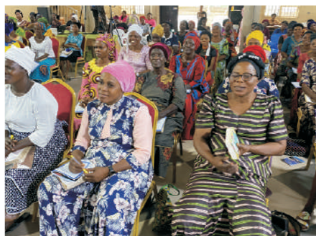
And they listened diligently