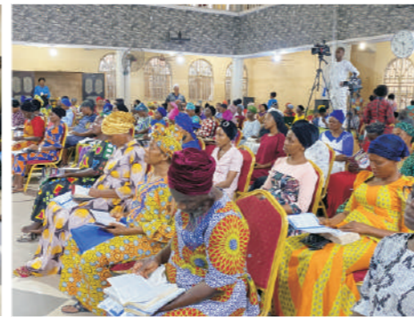
Cross Session of listeners