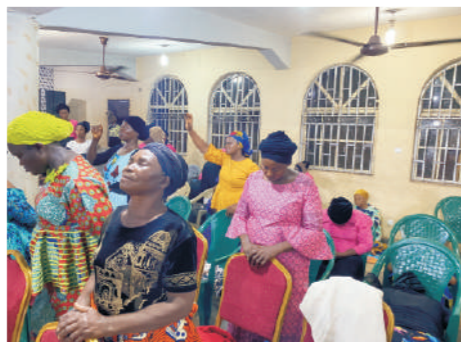
We Pray in the Holyghost