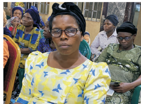
The Word like two edged sword