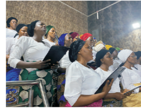
We wait on you Lord