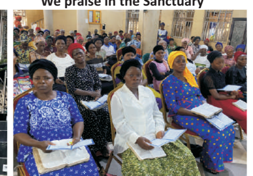
Made clean by the Word